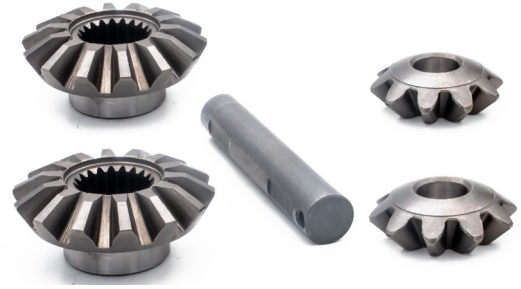
YCIW-4236-AA, 4041475 Diferansiyel Dişli Seti YCIW-4215-CA, 4053120 Differential Gear Set E7TW-4211-AA, 4110607 Z: 14X10