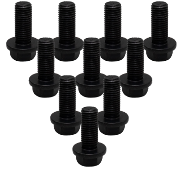
Cıvata Kiti Bolt Kit