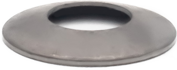
İstavroz Dişli Pulu Thrust Washer Side Gear