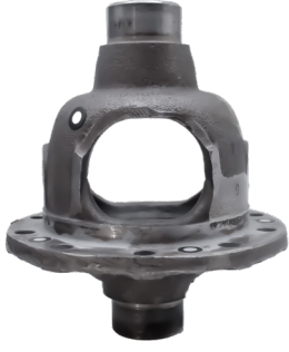
Diferansiyel Kutusu - Boş Differential Housing - Empty