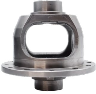
Diferansiyel Kutusu - Boş Differential Housing - Empty