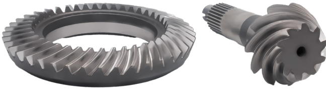
Ayna Mahruti Crown Wheel Pinion Z: 10X41 Ratio: 4.10