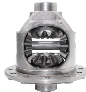
BK3W-4205-AA 1818018 V363

Diferansiyel Kutusu - Dolu Differential Housing - Full