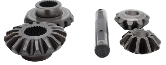
Diferansiyel Dişli Seti Differential Gear Set 10X16