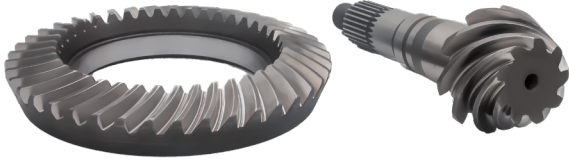
Ayna Mahruti Crown Wheel Pinion