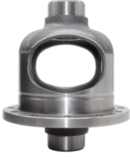
Diferansiyel Kutusu - Boş Differential Housing - Empty