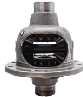
Diferansiyel Kutusu - Dolu Differential Housing - Full Z: 10X16