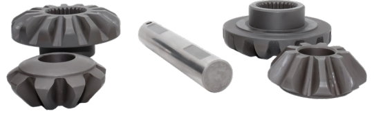
Diferansiyel Dişli Seti Differential Gear Set Z: 9X13