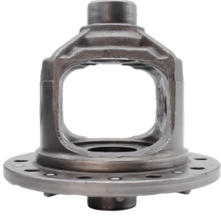
Diferansiyel Kutusu - Boş YCIW-4205-AA Differential Housing - Empty 4041470 V184