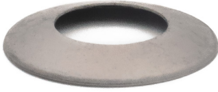
İstavroz Dişli Pulu Thrust Washer Side Gear