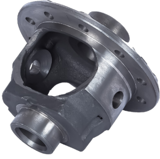
Diferansiyel Kutusu - Boş Differential Housing - Empty