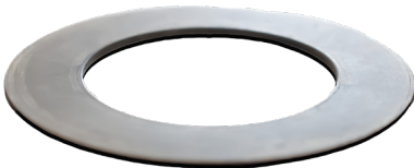
Aks Dişli Pulu Thrust Washer