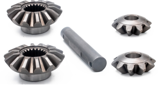
YCIW-4236-AA, 4041475 Diferansiyel Dişli Seti YCIW-4215-CA, 4053120 Differential Gear Set E7TW-4211-AA, 4110607 Z: 14X10