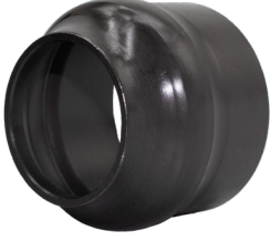
Mahruti Ayar Borusu Spacer - Pinion Bearing