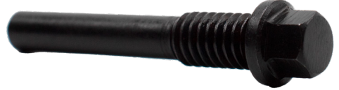
Istavroz Mil Pimi