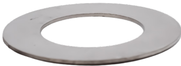
Aks Dişli Pulu Thrust Washer