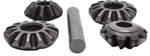
Diferansiyel Dişli Seti Differential Gear Set Z: 10X14