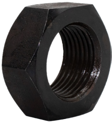
Mahruti Kilitleme Somunu Pinion Locking Nut