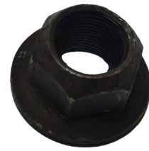
Mahruti Kilitleme Somunu Pinion Locking Nut