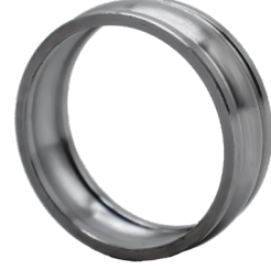
Mahruti Ayar Borusu Spacer - Pinion Bearing