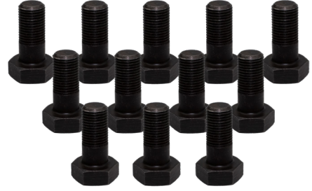
Cıvata Kiti Bolt Kit