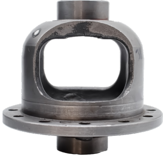
Diferansiyel Kutusu - Boş Differential Housing - Empty