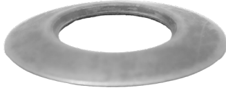
İstavroz Dişli Pulu E7TW-4230-AA Thrust Washer 3692693 Side Gear