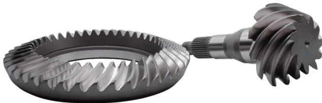
Ayna Mahruti Crown Wheel Pinion Z: 11X41 Ratio: 3.73