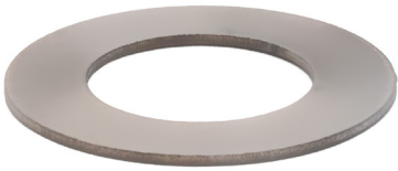
Aks Dişli Pulu Thrust Washer