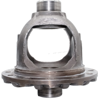
Diferansiyel Kutusu - Boş Differential Housing - Empty Düşük Tip - Low Type